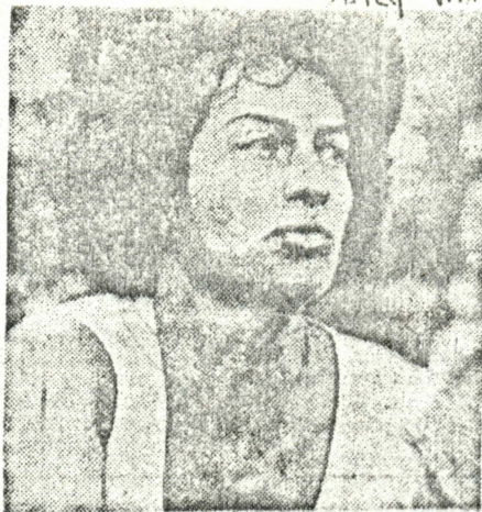
Former Wimbledon queen Virginia Wade.