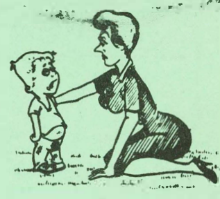
"We had a fight and I got knocked unconstipated."

"Since she learned how to hula hoop, she throws it up to me."