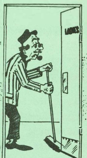
"Mind lifting your feet, Miss?"