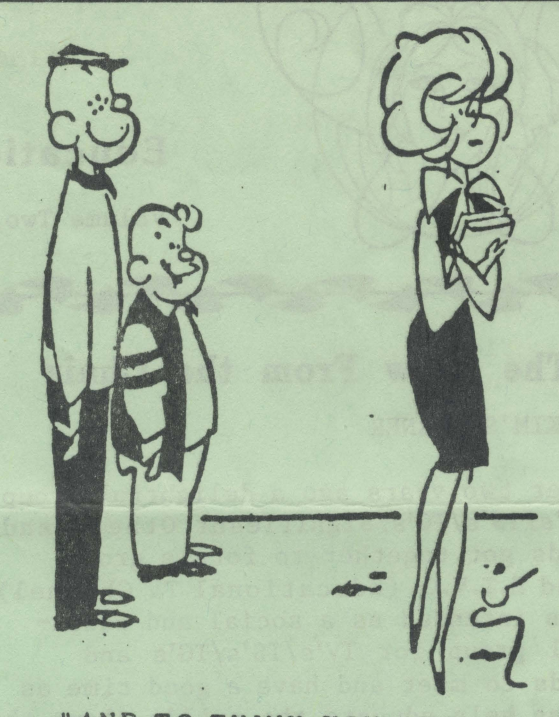
"AND TO THINK YOU AND I ONCE PLAYED FOOTBALL WITH HIM."

Due to the trans<sub>ition</sub> from last year's to this year's officers, the newsletter scheduled to be mailed after the May meeting was delayed. This is that issue. Production should be on track again and the next issue (Vol. 3, No. 1) is due out after the July party. Under the new Bylaws, an issue is scheduled every two months instead of three, so you'll be getting more frequent and up-to-date news. Thanks for your patience.