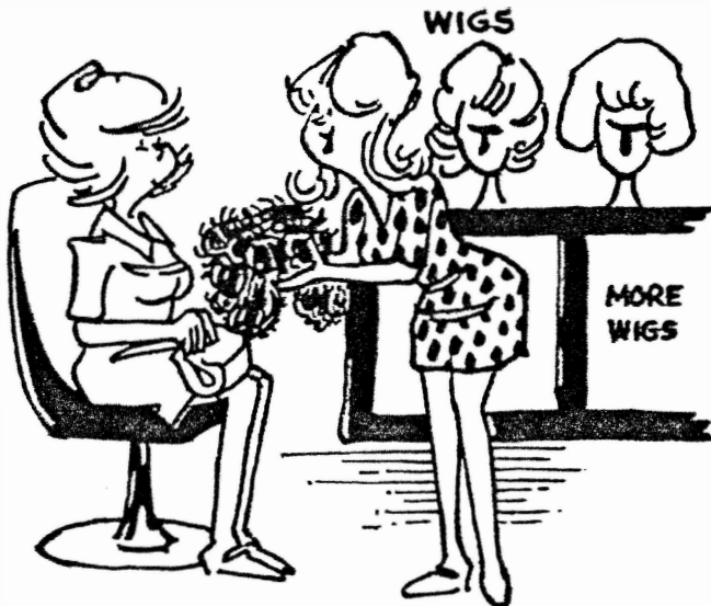
"THIS ONE YOU WEAR AT NIGHT... WHEN YOU GO TO BED!"