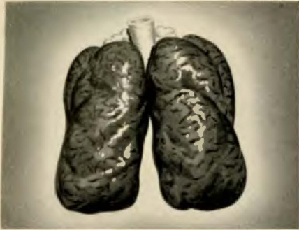
CITY DWELLER'S LUNGS