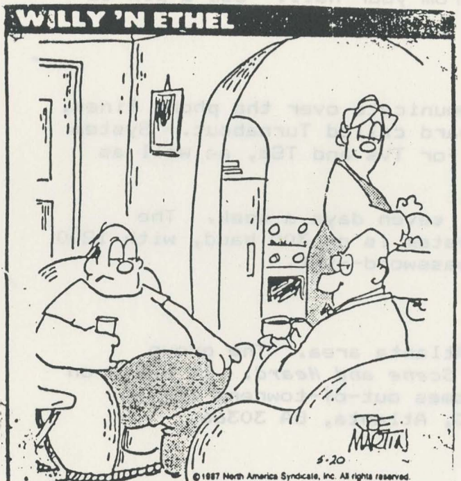
© 1987 North America Syndicate, Inc. All rights reserved. Why is it, when women wear men's clothes it's called 'Dress For Success', but when men wear women's clothes it's called WEIRD???