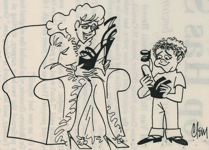
"Now that Daddy's dead, are you man enough to fill his shoes?"

"As far as we are concerned, he is a woman," said a spokesman, who asked not to be named.