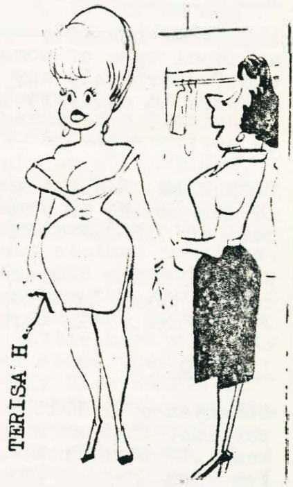
"Even your Mother would not know you, sir."