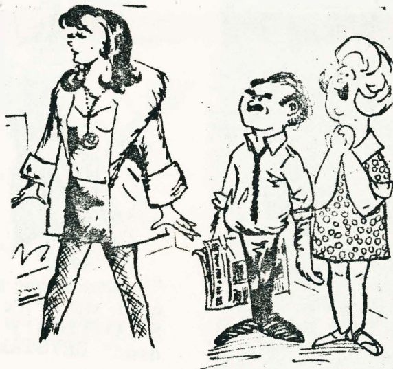
"I Always wanted a daughter!"

NATCHES, Miss., prohibits the ingesting of beer by elephants.