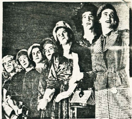
BOYS WILL BE GIRLS All dressed up in the latest fashions, members of the University of Pennsylvania's "Adamant Eve" production got together for an impromptu fashion show in the Wanamaker store yesterday. The first performance of the show, "Adamant Eve," will be given Nov. 17.