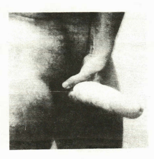
Figure 3 Completely formed neo-penis - silicone stiffening rod has been been inserted down hollow shaft to allow erection.