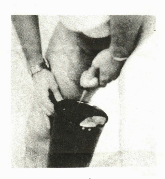
Figure 4 Urinary conduit constructed down center of neo-penis and urinary hook-up is complete.