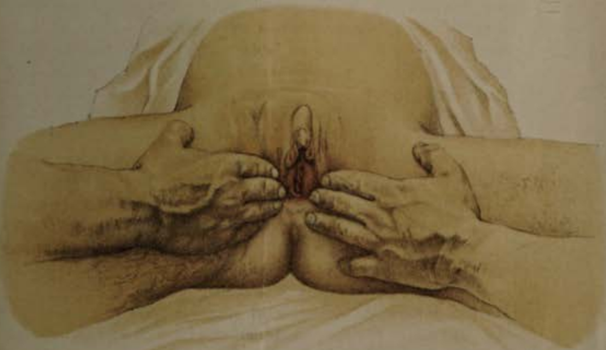
PSEUDO-HERMAPHRODITISMUS BILATERALIS EXTERNUS. ANGIOSARKOMA OVARIUM DUPLEX - K R U G .