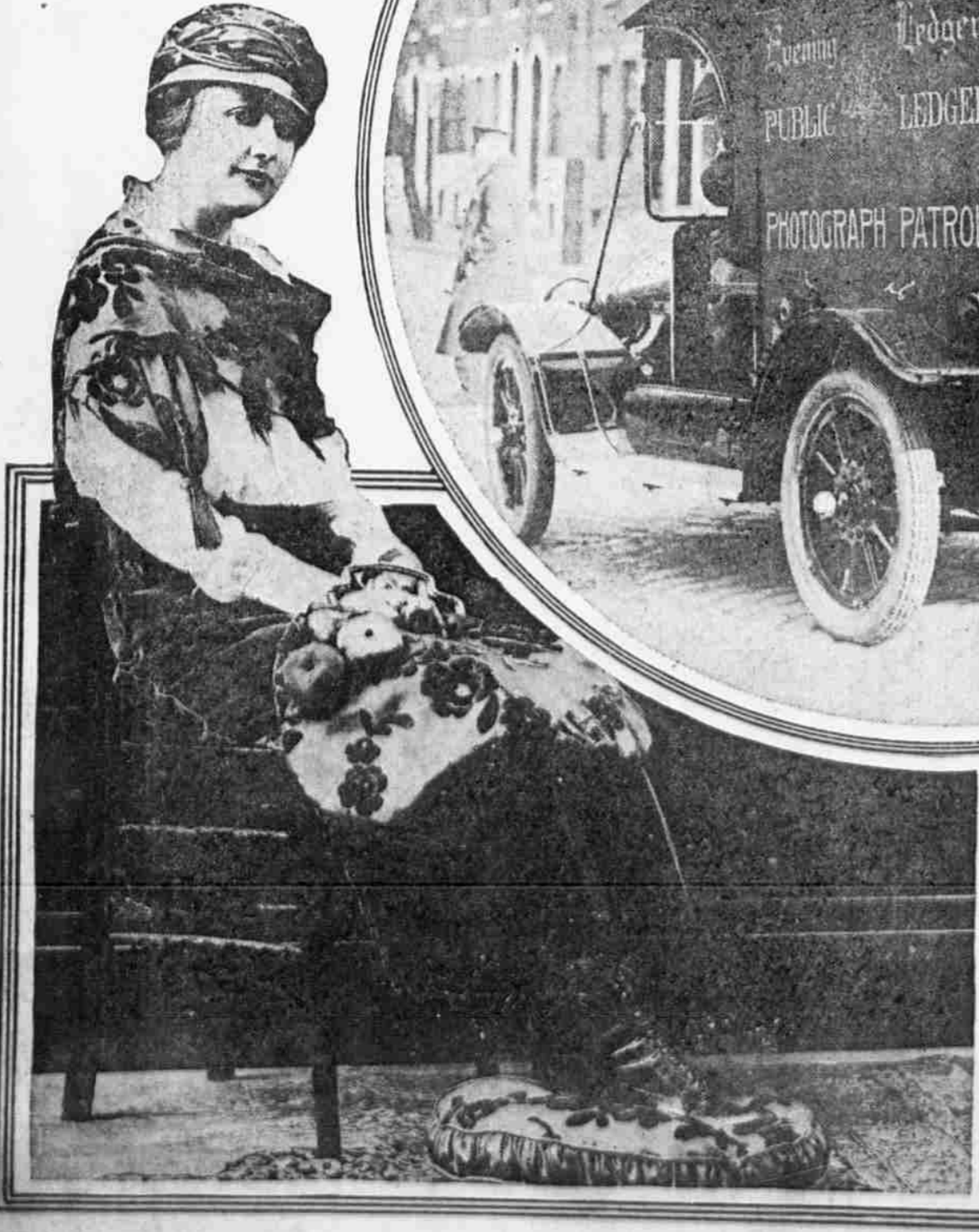
BEACH COSTUME FOR THE SOUTHERN SANDS A novel arrangement for Palm Beach wear—gold colored velvet brocaded chiffon, with touches of Mattier blue and green on scarf and cushion.