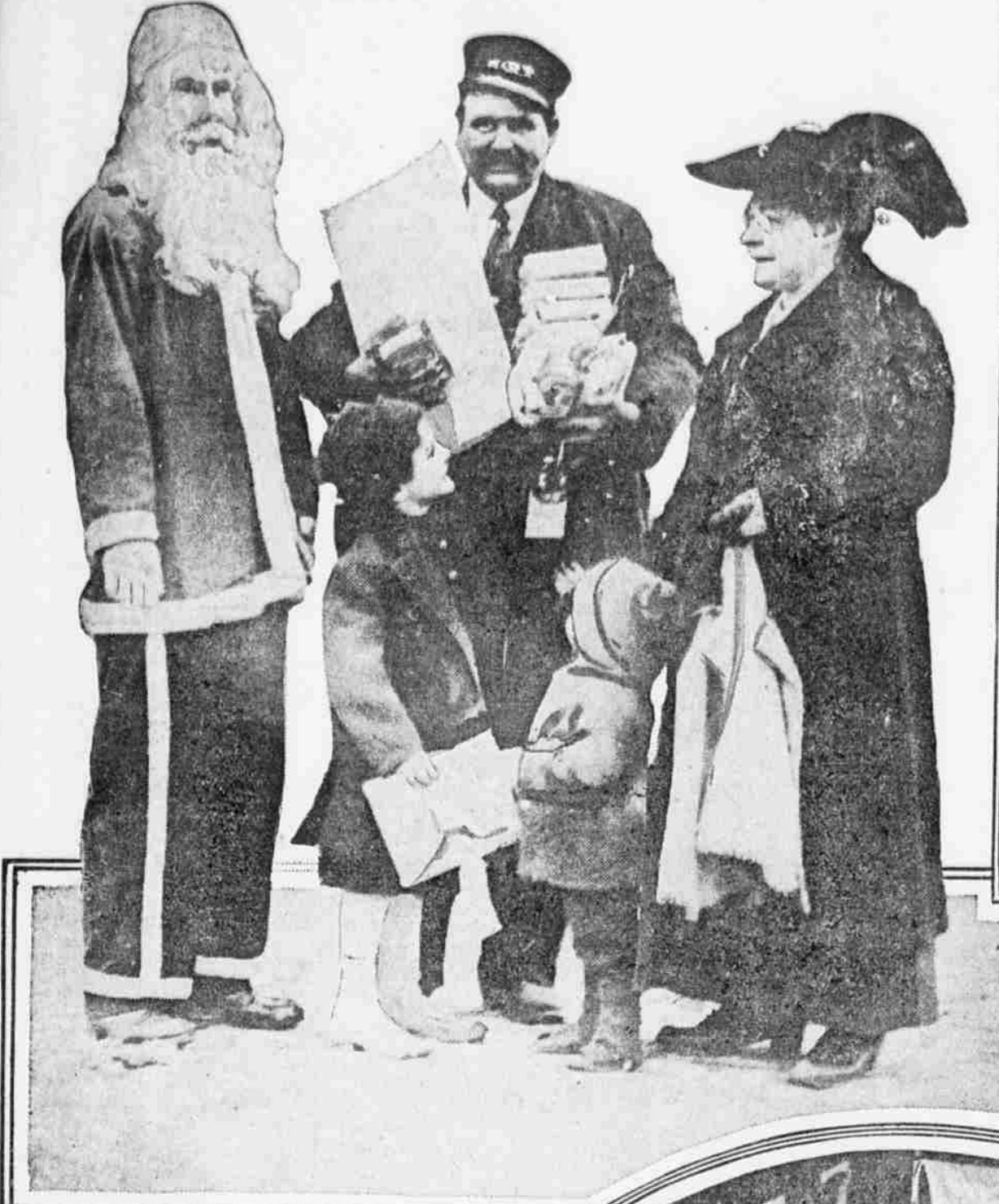
CAMDEN TROLLEY MEN GIVE PARTY FOR KIDS Santa Claus was a trifle late in reaching the Newton avenue car barn, but held a reception there yesterday and provided many good things for the children of the conductors and motormen.

NOTES AND NOVELTIES IN THE NEWS OF THE DAY AS CAUGHT BY THE CLEVER CAMERA MAN