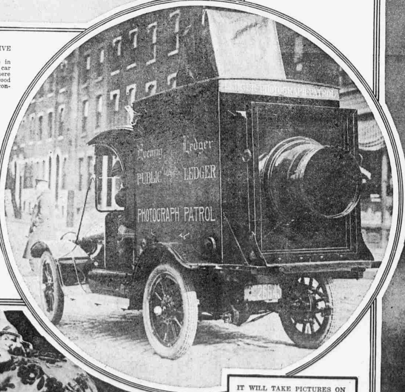
IT WILL TAKE PICTURES ON THE FLY This novel car was built exclusively for the use of the Ledger staff of photographers and is equipped for high speed and fast work. It will be seen on the streets for the first time tomorrow. It is the only car of its kind in the country.