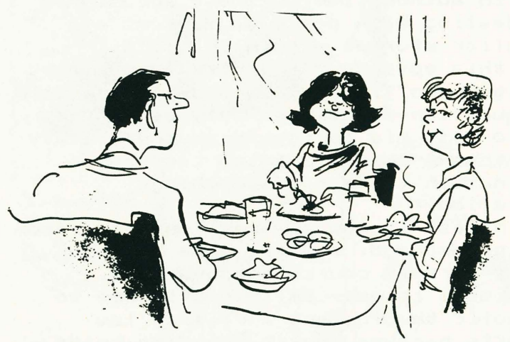
"You should be happy he wears his hair long, you can't see his earring."

Remember the P.O. box is yours to use. Feel free to use it for correspondence you are not sure of. Send mail to: TGIC, P.O. Box 13604, Albany, N.Y. 12212-3604 ATT. your fem or masculine name first and possibly last name initial as we have it on our sheet and a stamped envelope for return.