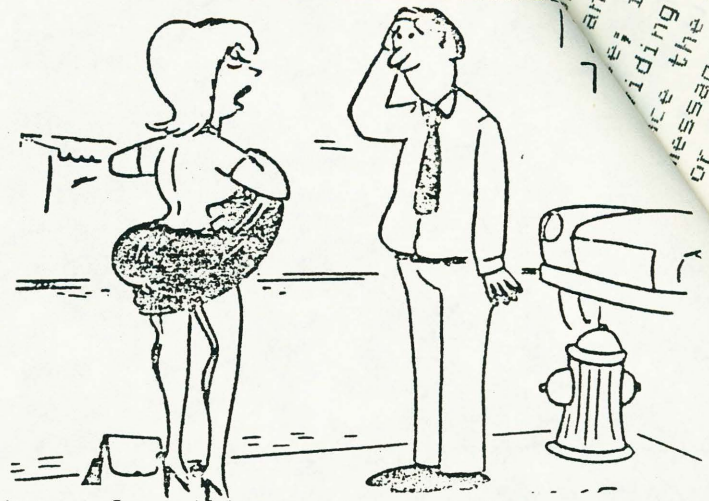
"OK mister! Does this convince you I'm a man and don't want to be picked up?"

There are children "born with the male chromosome pattern and testes but an impaired ability to either produce or respond to testosterone. Most are raised female and, if necesssary, treated surgically and hormonally to correct their abnormalities."