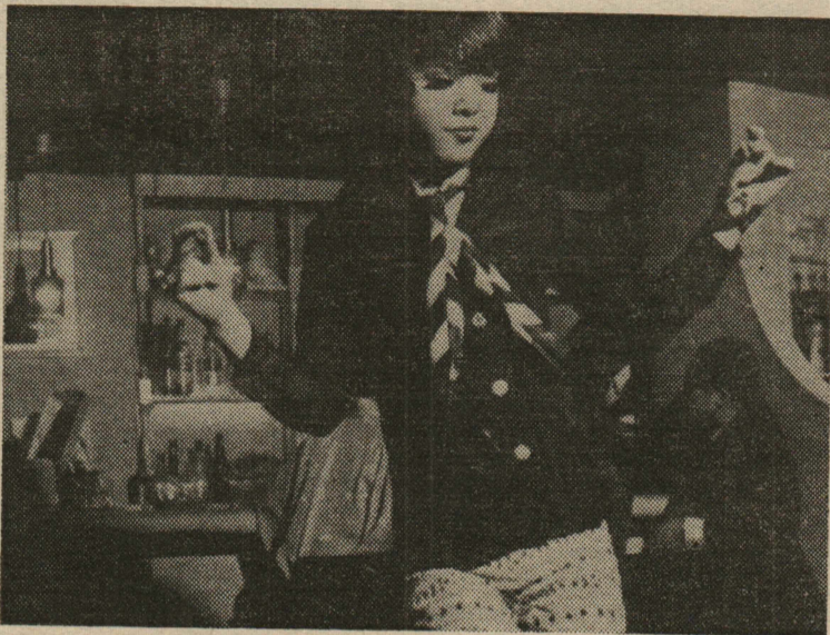
Formerly, Peter was a gay boy in a Tokyo gay bar.

Peter has been brought up by his mother and an older sister.