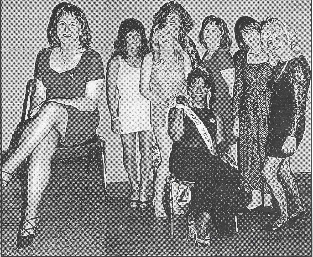
TGSF TransGender San Francisco is a group for all members of the Transgendered Community. Transgender is used as an umbrella term that includes female and male cross dressers, transvestites, drag queens or kings, female or male impersonators, intersexed individuals, pre-operative, post-operative and non-operative transsexuals, masculine females, feminine males, all persons whose perceived gender or anatomical sex may be incongruent with their gender expression, and all persons exhibiting gender characteristics and identities which are perceived to be androgynous.