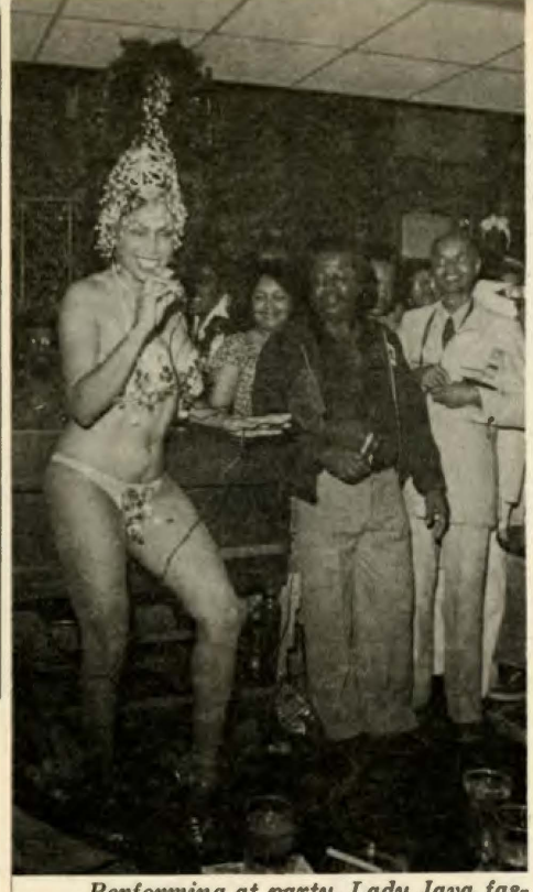
Performing at party, Lady Java fascinates both men and women guests as she sings and does an exotic dance to the delight of the crowd.