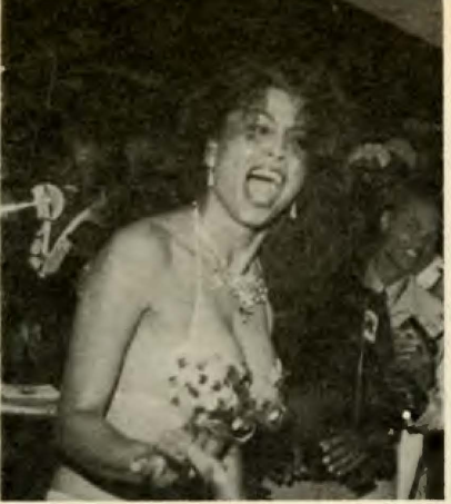
Belting a bouncy song, Java sheds headpiece and thrills excited fans.