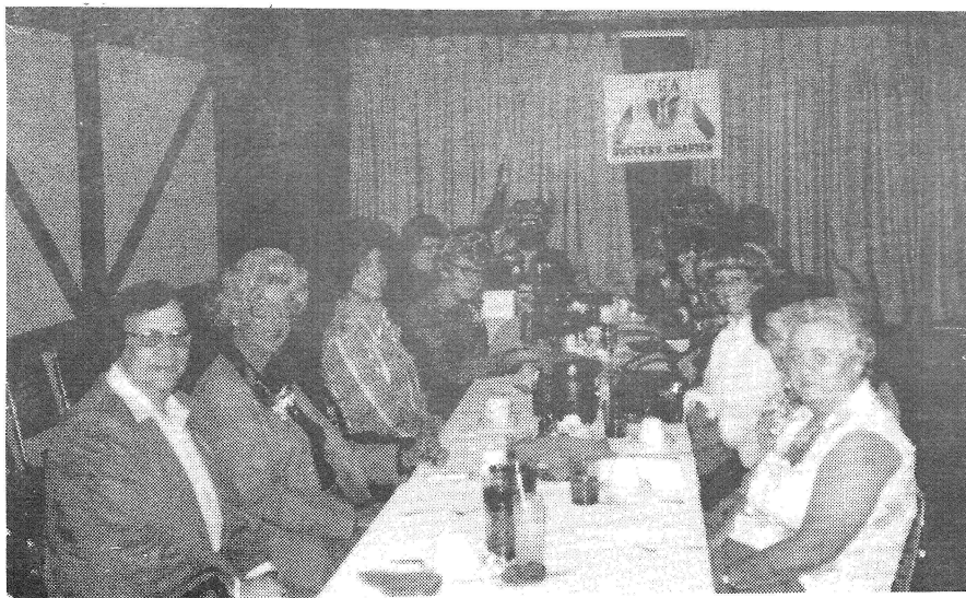
bottom left to bottom right.