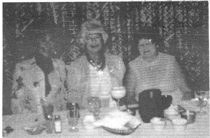
left to right