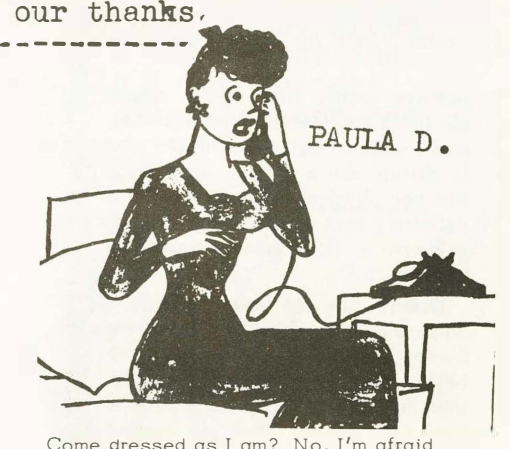
Come dressed as I am? No, I'm afraid my fraternity brothers might not understand."