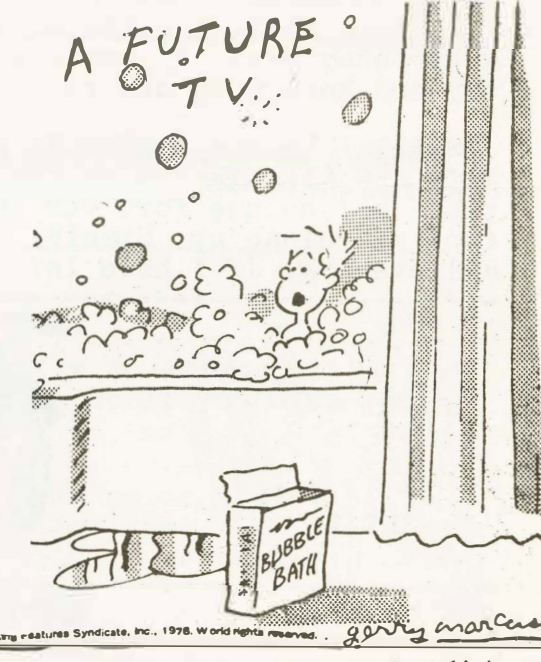
"Now, remember, Mom - not a word about this to my friends!"

"How do I go about getting a man who'll buy me a meal like this?" o