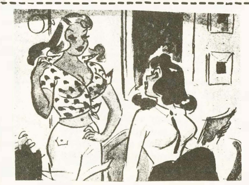
"I WON'T take off this tie, honey. How else will anybody know I'm a man!"