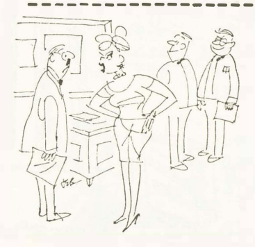
"...and make them stop calling me STR!"

Special Thanks; SUSSANE for the books she sent als REENE for the book she left and also thanks to the girls that sent in clothes shoes and wigs that they had no use for. Our thanks to all the girls who helped Helen with the food and clean up. Special thanks to Gale for helping Helen in the Kitchen all evening. If i have left anyone out please except our thanks.