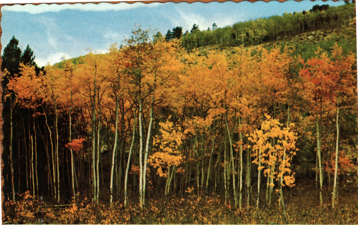
Rocky Mountain National Park