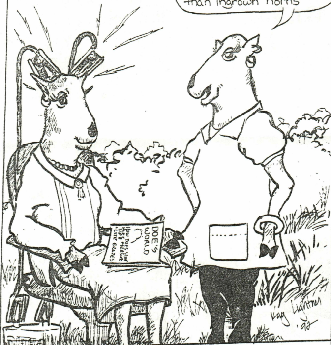
For the transsexual buck, antler electrolysis can be a long, difficult process

And please, don't try to pull them again. There's nothing worse than ingrown horns.