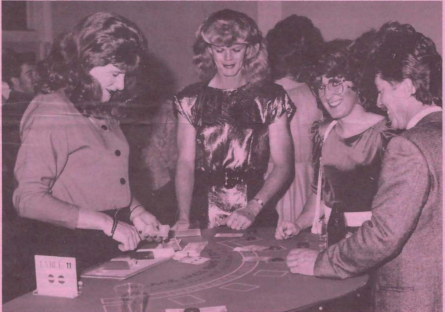
ETVC and Tri-Ess members enjoy an exciting evening of entertainment and gambling.