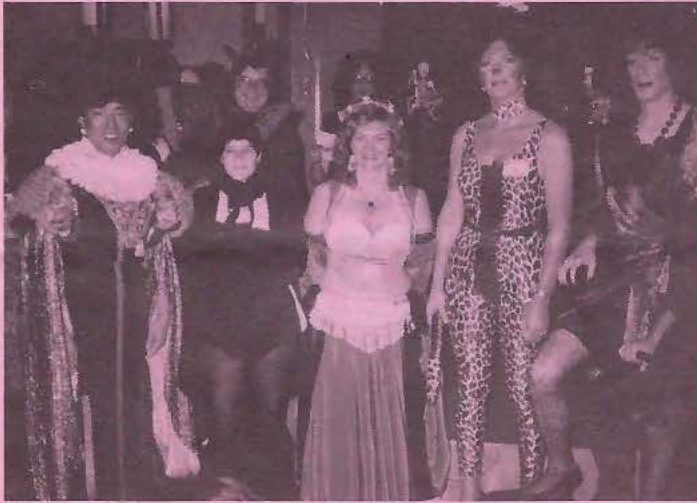
Just a small sample of the creative costumes evident at the ETVC Halloween party.