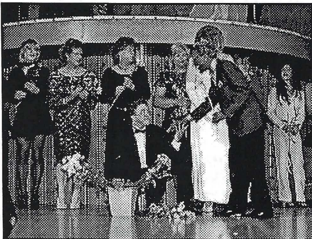
Debutantes receive their due at Cotillion 2002