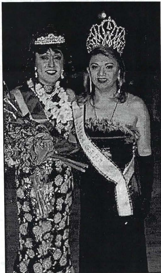
Miss TGSF with Miss GAPA