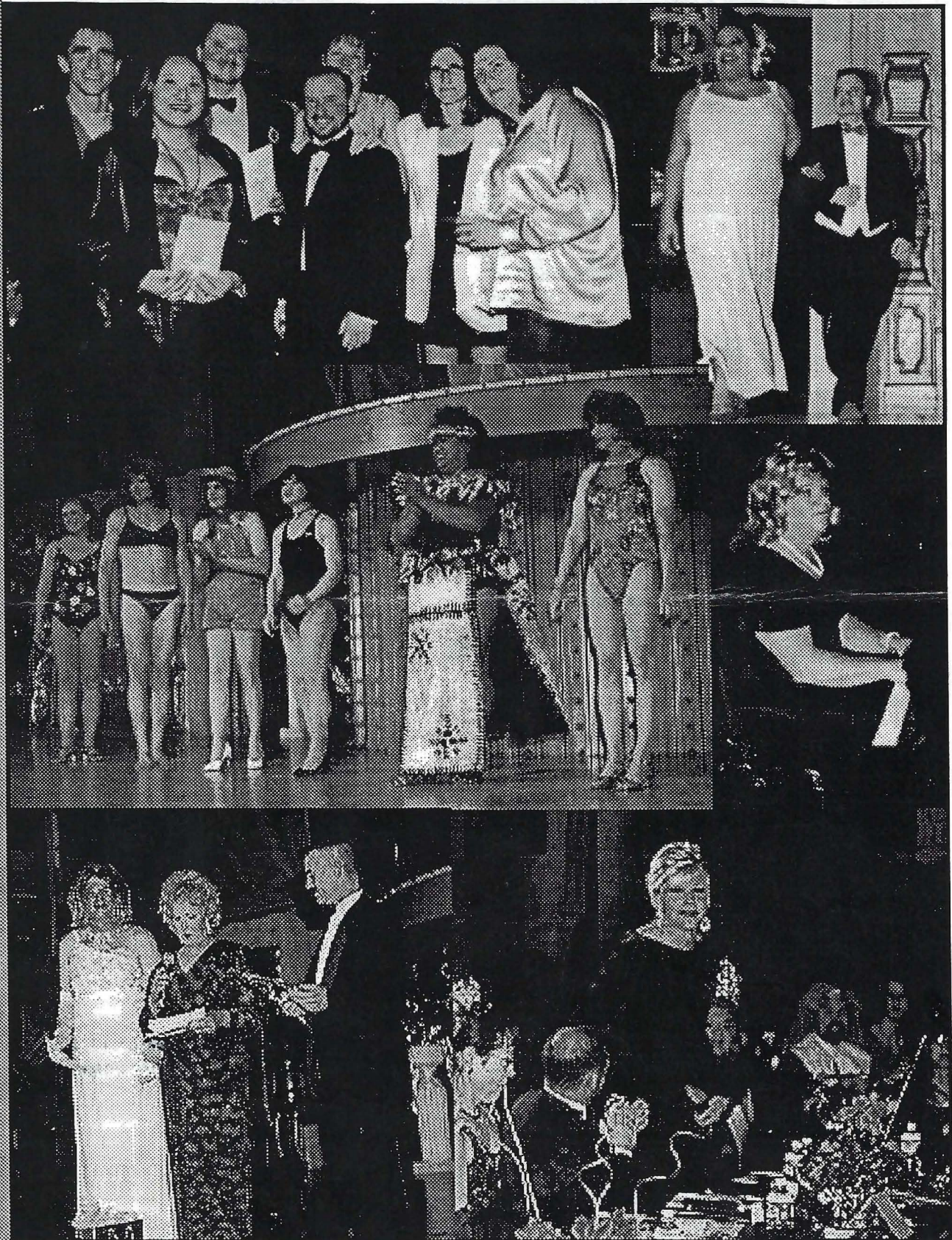
TGSF TransGender San Francisco is a group for all members of the Transgendered Community. Transgender is used as an umbrella term that includes female and male cross dressers, transvestites, drag queens or kings, female or male impersonators, intersexed individuals, pre-operative, post-operative and non-operative transsexuals, masculine females, feminine males, all persons whose perceived gender or anatomical sex may be incongruent with their gender expression, and all persons exhibiting gender characteristics and identities which are perceived to be androgynous.

TransGender San Francisco (formerly ETVC)