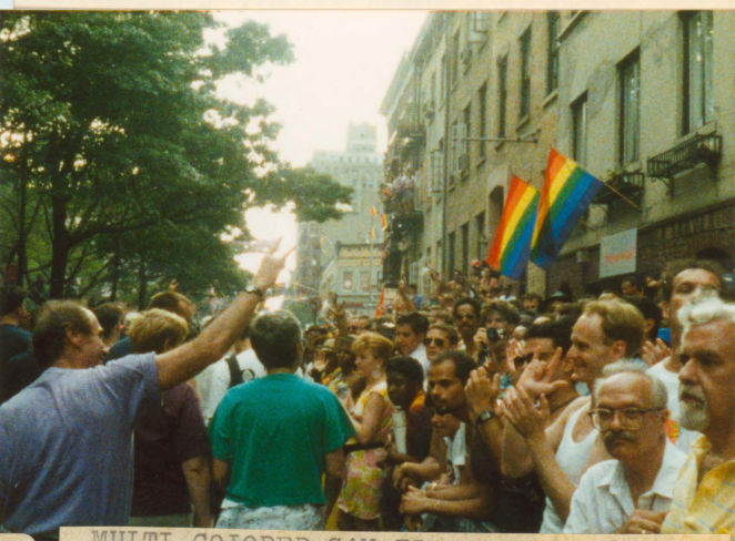
MULTI-COLORED GAY FLAGS HANG IN FRONT OF THE STONEWALL ON GAY PRIDE DAY. THE ONLOCKERS GIVE ESPECIALLY WARM RECEPTIONS TO GMHC, PARENTS OF GAYS,&

Later, for laughs, we'll go to the Christopher Street Festival and, at the Hug-a-PWA booth, tout tickets to that evening's sold-out dance on the pier--at greatly inflated prices, of course. We'll work the crowd. And we'll actually see the money flow in. After dark, we'll visit the dance, watch the dazzling fireworks, capture the evening's romance as lovers smootch at riverside.