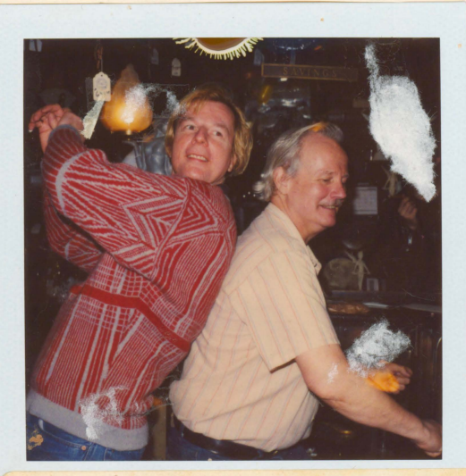
THEY HAD TO HAVE HAD SOME GOOD SPANISH MUSIC ON TO GET BILL & I GOING LIKE THIS!!

The merriment was only momentarily broken. Physical violence was averted but not without some tense moments. The Bensonhurst duo retreated after Muffy, one of our tempoarary summertime helpers, rushed up to them shouting in their faces: "Go ahead! Fuck me over! Because I've got Aids and I'll get it all over you!!" (You've gotta see it to believe it.)