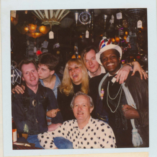
IT WAS A YEAR TO PARTY & 1991 GOT OFF TO A GREAT START!