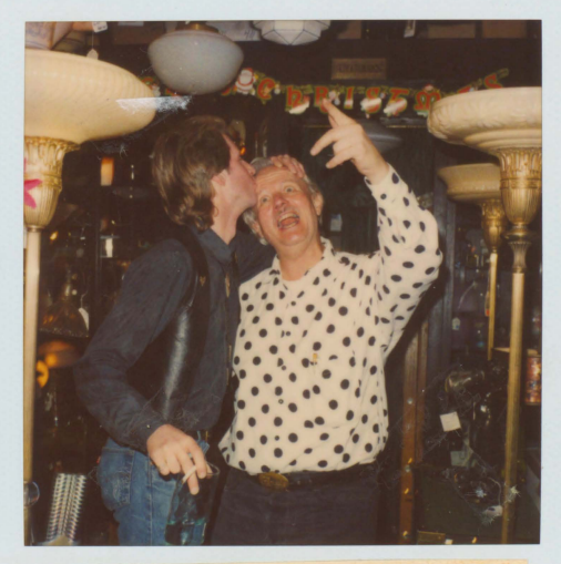
ALL THAT DANCING! ALL THAT DRINKING & NOT ONE LAMP GOT BROKEN!!

Around here, everyone's alive, if not exactly well. During August I really began to feel like I was fitting in. Fatigue, a bacterial lung infection & a blood test taken after a Big Mac, fries & two beef franks indicated I was in the "highest" risk group for thatmost terminal of illnesses- coronary disease!!