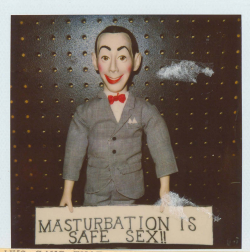
AND WHO SAYS THAT JUST BECAUSE YOU HAVE AN AIDS THEME IN YOUR WINDOW, YOU CAN'T HAVE A SENSE OF HUMOR TOO!