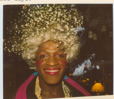
AND SHE STILL HAD ENOUGH LEFT OVER TO LOOK FABULOUS FOR THE HOLLDAYS!