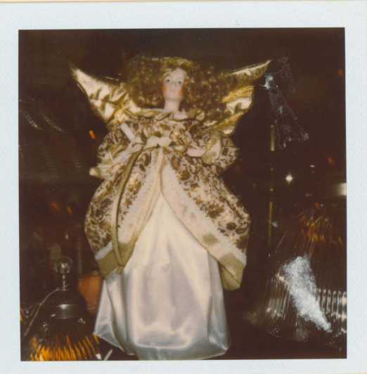
ALL AROUND THE SHOP, LIGHTED & MOVING ANGELS WAVED & FLAPPED THEIR WINGS TO IMPROVE SALES!

But, once inside, they found all those <u>living</u> angels I've been so fortunate to have, by my side, helping me carry on this business called life.