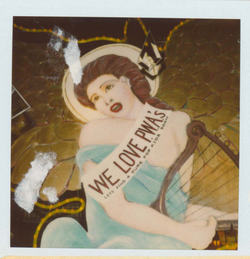
VEN FOOT HIGH ANGELS CUT OUT OF WOOD DOMINATED UPLIFT'S TWO WINDOWS. EACH CARRIED A MESSAGE ABOUT AIDS IN KEEPING WITH THE AIDS THEME IN OUR XMAS WINDOWS.

Perhaps they were drawn by the two huge angels dominating the windows; or by the little bands of angels surrounding David's box & our wedding pictures. Maybe, they were charmed by those flying angel ornaments carrying a golden goose--or hypnotized by those lighted, moving angels flapping their wings on every pedestal & counter.