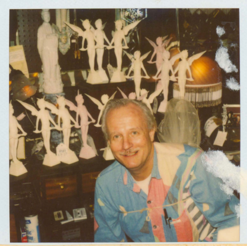
FAMOUS ATHEIST DOES EXPERIMENT TO SEE HOW MANY ANGELS CAN DANCE ON